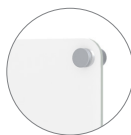
Radius Corners with Stand-off Hangers