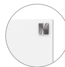
Square Corners with Stand-off Hangers